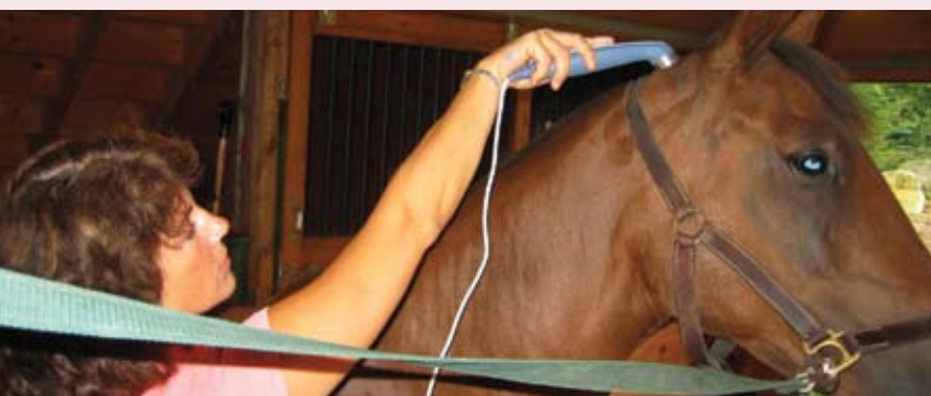
Ultrasound to the poll for pain relief and increased extensibility of tight structures.

Diagnostic ultrasound (dUS) is customarily used by veterinarians to view internal tissue integrity. dUS works in the same manner as tUS, only with higher frequencies of 3 to 7 MHz (Stashak, 2002). Echoes are generated whenever the sound beam crosses a boundary between structures of differing acoustical impedance. Returning echoes generate electrical pulses that are electronically manipulated and displayed on a monitor for vet and client viewing (Stashak, 2002).