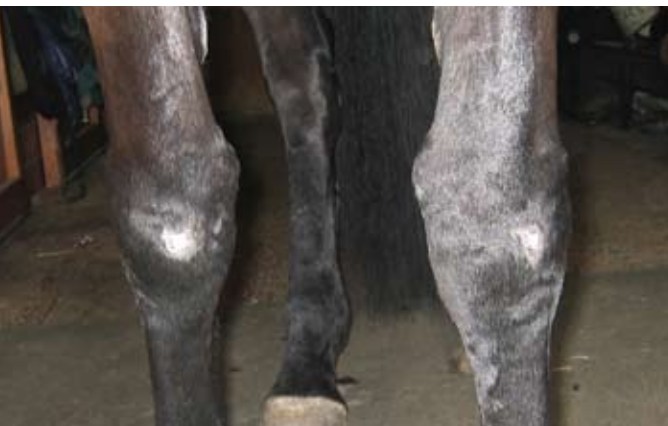
Wounds nicely healed 6 weeks post physical therapy intervention with US.