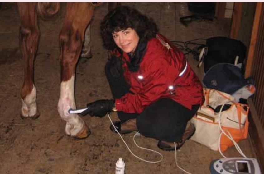
Author applies US to suspensory branches for promotion of healing structures.

A second study done by Moraes, et al, states that, “tUS energy is capable of producing cellular changes by mechanical effects. Its mechanism of action is correlated with activation of fibroblasts and collagen, stimulating the blood flow, anti-inflammatory properties, anti-edematous and analgesic, promoting tissue relaxation and decrease of local pain. The treatment used with the tUS was crucial for local analgesia in these horses, as no other analgesic therapy was used. The use of tUS should be included in the treatment of acute pain in horses, since it is non-invasive and effective.” (Moraes, J., 2009).