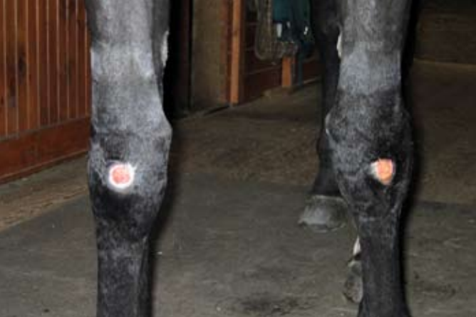
US can be used to accelerate wound healing.